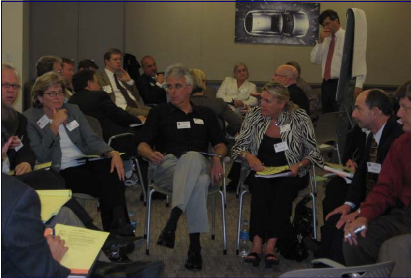
Part of the day-long e-Health stakeholder meeting involved small group discussions that allowed participants to cover critical topics in the Manatt report, such as clinical framework, financials, governance and policies and standards.